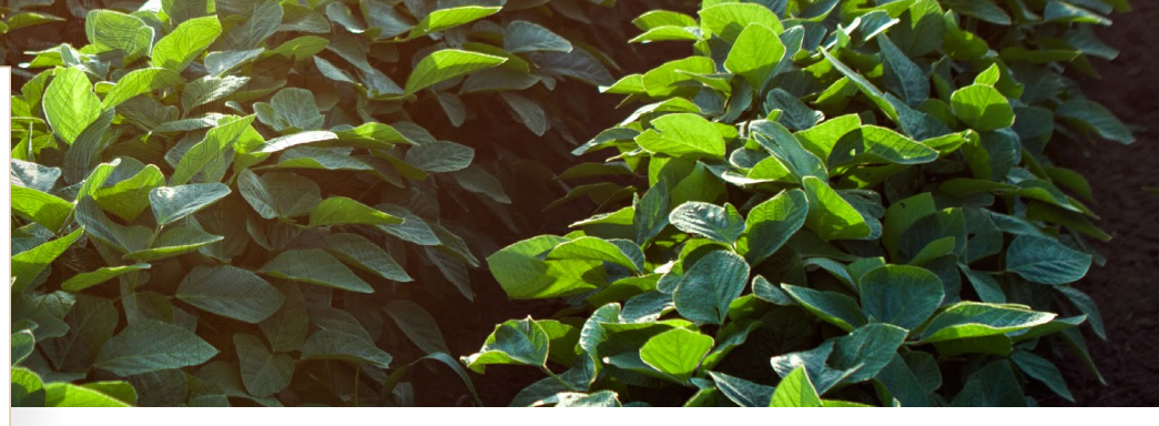
The best soybean management practices by Extension researchers from across the United States