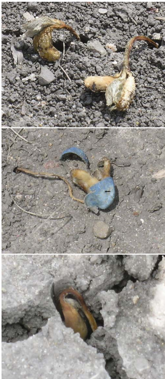
Fig. 2. Soybean seedlings with symptoms of damping-off caused by Phytophthora sojae on both treated and nontreated seed. Note the presence of seed coat above soil surface following germination of seedlings.

and candidate lines to root rot caused by P. sojae . P. sojae isolates from the field study locations contained a complex virulence formula as demonstrated by their ability to infect soybeans with Rps1a , 1k, 6, or 8 as well as additional differentials. In 2004, three seed treatments including mefenoxam, 3.75 g a.i. and fludioxonil, 2.5 g a.i./100 kg seed (Apron Maxx RTA); mefenoxam, 3.75 g a.i. and fludioxonil, 2.5 g