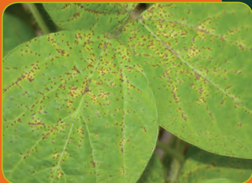
Upper leaf symptoms