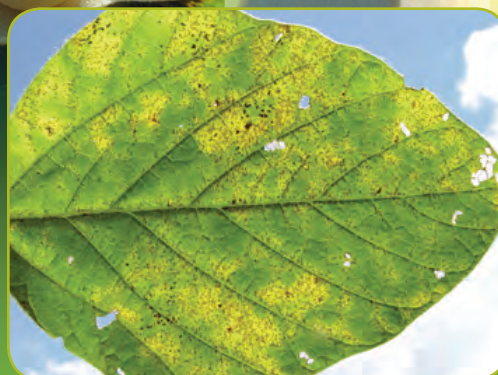
Back lit leaf