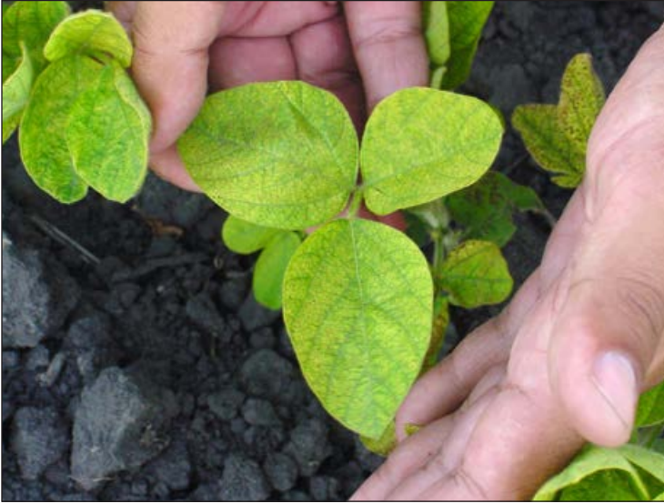
Figure 1. Iron deficiency chlorosis can cause yield loss in certain regions of the United States.