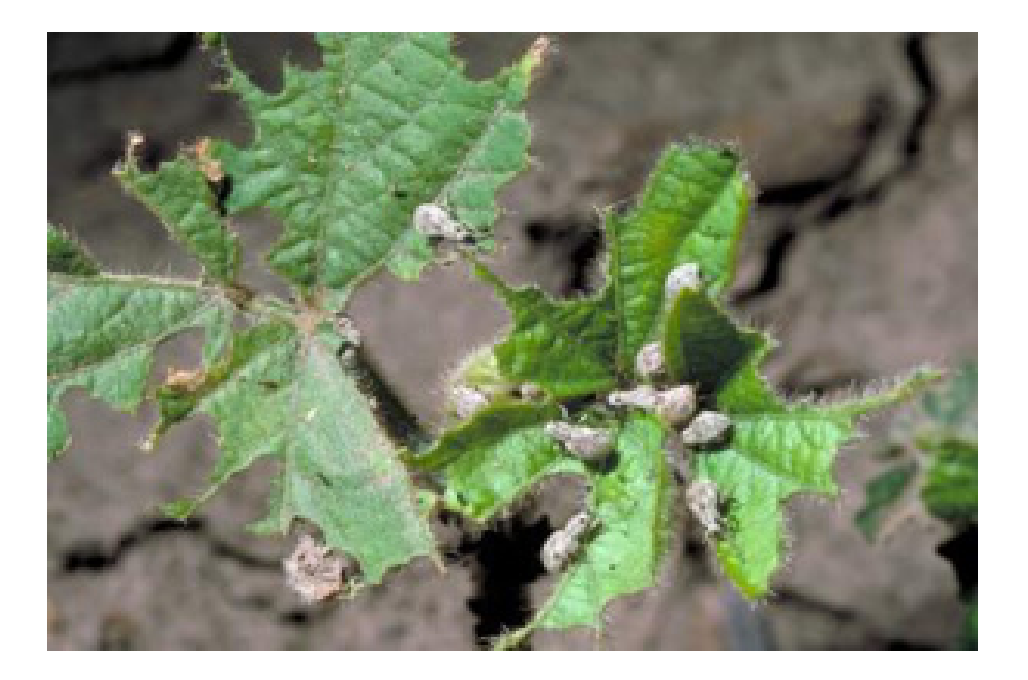
Figure 2. Imported longhormed weevil damage on soybean.

As you scout for grasshoppers and two-spotted spider mites, look for the ILW, too. The weevils are found on soybean in late June to early July, when they feed on leaf tissue and smaller veins, usually from the seedling to V4 stage of soybean development. Their feeding causes a ragged, scalloped leaf border and tends to be found mainly on field margins (Figure 2).