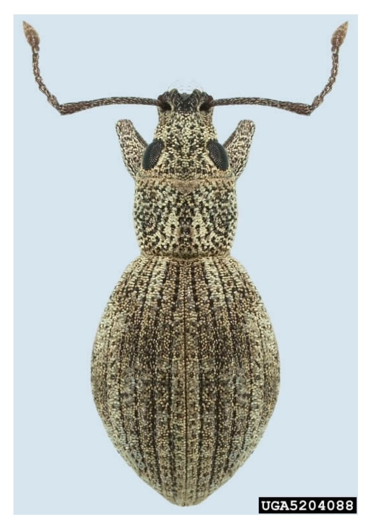
Figure 1. Adult imported longhorned weevil.