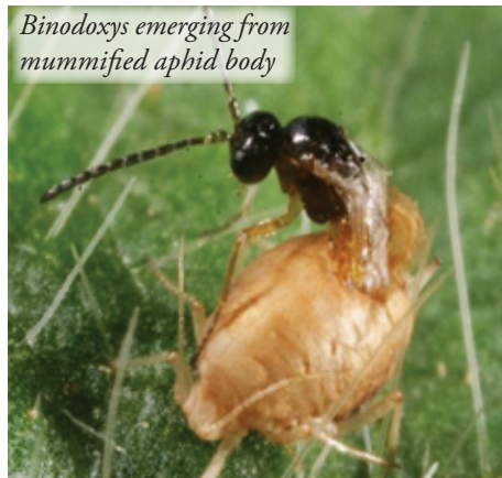
Binodoxys emerging from mummified aphid body