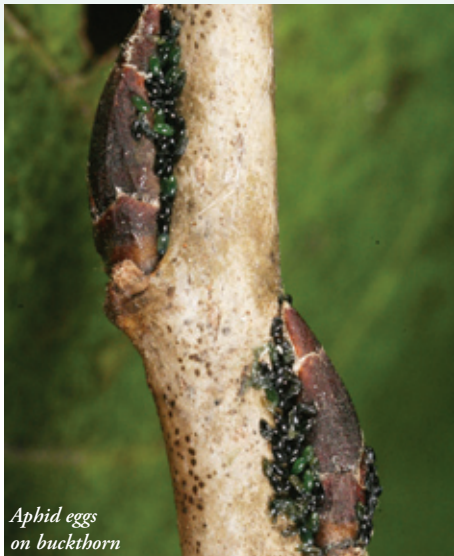
Aphid eggs on buckthorn