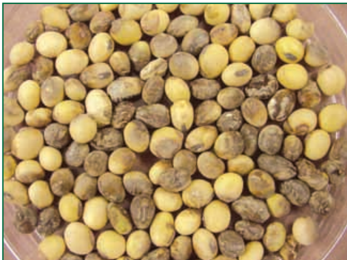
Figure 4. Seed damaged by frogeye leaf spot and other pathogens.

seeds may show a range of symptoms (Figure 4). They may have no symptoms, or they may appear dark, shriveled, and may have a cracked seed coat.