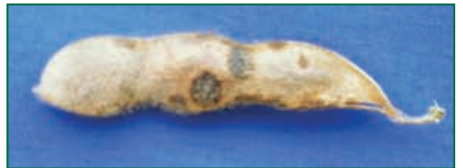
Figure 3. Soybean pod lesions caused by the frogeye leaf spot pathogen.