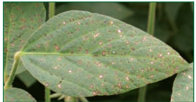
Figure 1. Leaf symptoms of frogeye leaf spot.

Under humid conditions, lesions on any part of the plant may develop dark centers when the fungus is producing spores. The fungus that causes the disease may grow through the pod walls and invade seed. Infected