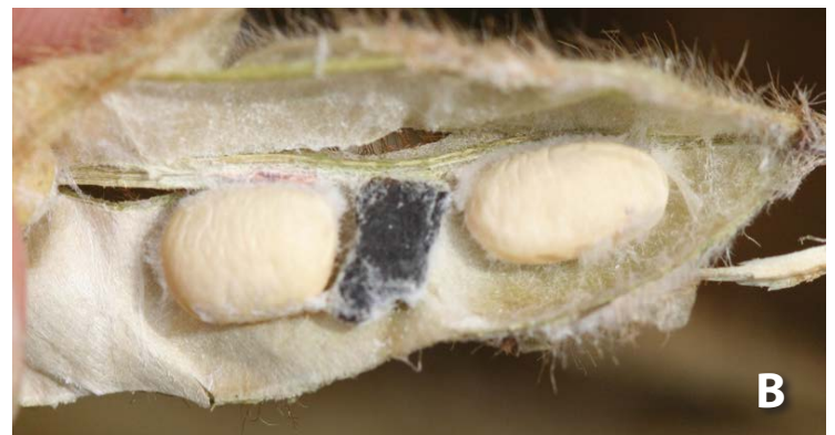
Figure 1. (A) Sclerotia of S. sclerotiorum in harvested grain, and (B) infected seed with a sclerotium in a pod.