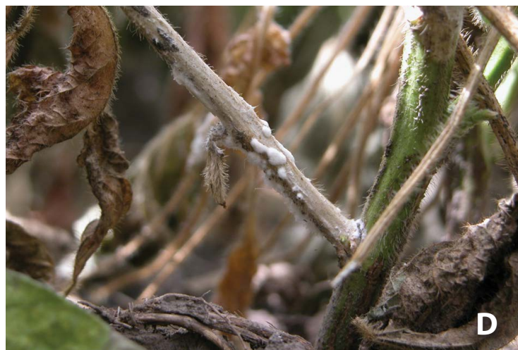
Figure 2. The three components required for white mold to occur are: (A) susceptible soybean varieties that are flowering, (B) apothecia, which produce S. sclerotiorum spores, and (C) a cool, wet environment, especially under the soybean canopy. When all occur at the same time, white mold (D) can develop.