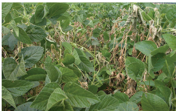
Figure 5. Symptoms of white mold include wilting, lodging, and plant death.