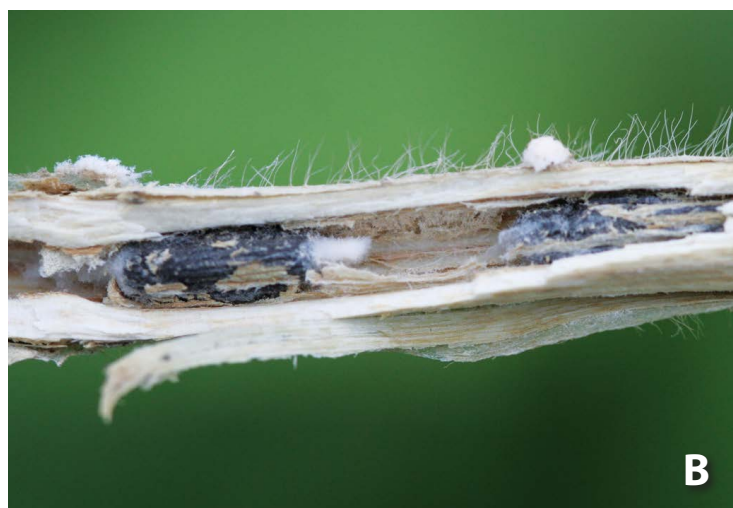
Figure 4. (A) Apothecia of S. sclerotiorum , and (B) bird's nest fungus, a saprophyte sometimes confused with S. sclerotiorum apothecia. However, bird's nest fungus and other fungi that look like apothecia do not grow from sclerotia.