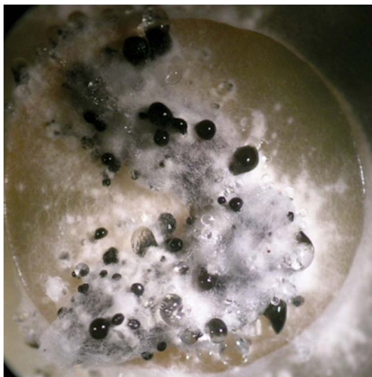
Figure 7. Sclerotium of S. sclerotiorum colonized by Coniothyrium minitans .

Application of C. minitans should occur a minimum of three months before white mold is likely to develop. This allows adequate time for the fungus to colonize and degrade sclerotia (Figure 7). Degraded sclerotia will not