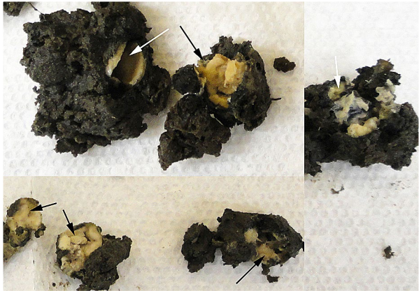
Figure 2. Decayed seed (arrows) due to infection by Pythium . (NDSU)