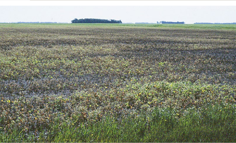
Figure 1. Damping-off of soybean in a field following heavy spring rains. (NDSU)