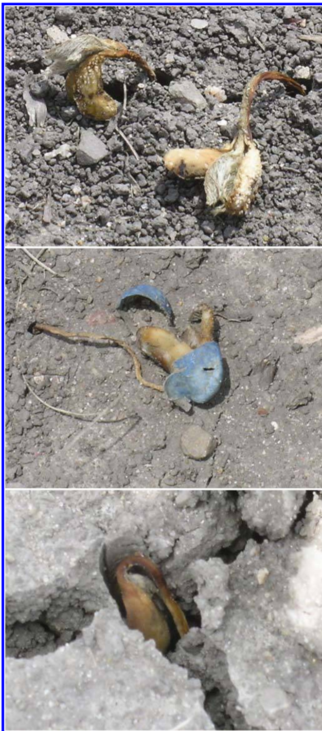
Fig. 2. Soybean seedlings with symptoms of damping-off caused by Phytophthora sojae on both treated and nontreated seed. Note the presence of seed coat above soil surface following germination of seedlings.

and candidate lines to root rot caused by P. sojae . P. sojae isolates from the field study locations contained a complex virulence formula as demonstrated by their ability to infect soybeans with Rps1a , 1k, 6, or 8 as well as additional differentials. In 2004, three seed treatments including mefenoxam, 3.75 g a.i. and fludioxonil, 2.5 g a.i./100 kg seed (Apron Maxx RTA); mefenoxam, 3.75 g a.i. and fludioxonil, 2.5 g