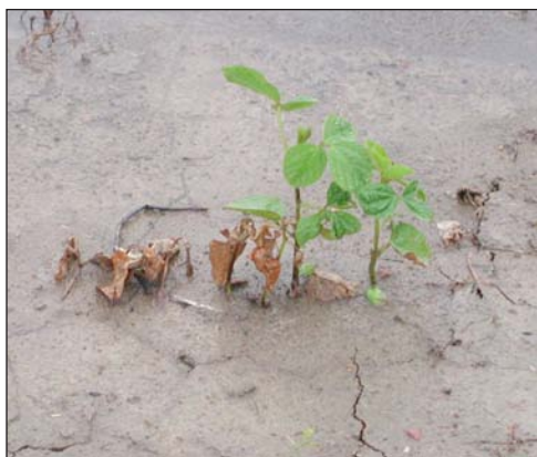
Figure 1. Phytophthora damping off in field.

The disease is most severe in poorly drained soils with high clay content. Traditionally, the northwest section of the state has had severe problems with Phytophthora damping off and root rot. With the