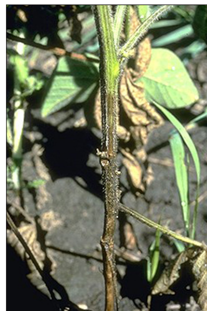
Figure 2. Phytophthora stem rot—adult plant showing stem discoloration.

Phytophthora can attack soybean plants at any stage of development. Symptoms in young plants include rapid yellowing and wilting accompanied by a soft rot and collapse of the root. More mature plants generally show reduced vigor and may be gradually killed as the growing season progresses. Foliar symptoms