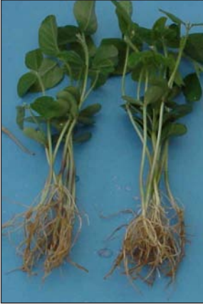
Figure 5. Phytophthora seed treatment low rate.