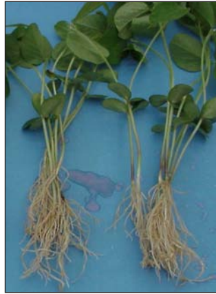
Figure 6. Phytophthora seed treatment high rate.

combination. If Rps genes do not provide adequate control or you are unsure, select varieties with highest levels of partial resistance. These would be scores of 3.5 to 4.5 (these scores are the highest and point to the best levels of partial resistance).