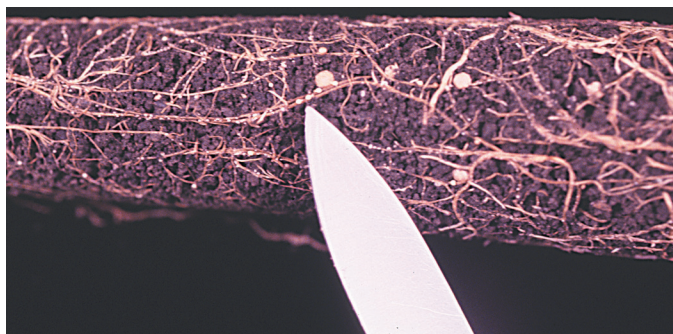
Three white SCN females (at knife tip) on roots of soybean plant in follow-up greenhouse test of soil samples with low SCN egg counts.