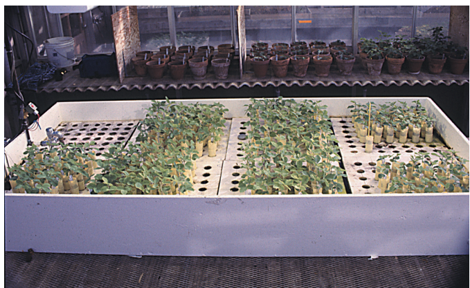
Soybean seedlings growing in temperature-controlled water bath used to conduct the follow-up greenhouse test of soil samples with low SCN egg counts.

To double check that a sample with a low egg count is truly infested with SCN, a seedling of an SCN-susceptible soybean variety is transplanted into the soil remaining from the sample after the initial 100 cc of soil has been processed. The seedling is grown under controlled temperature and light conditions for 28 to 35 days in a greenhouse, then the roots are carefully observed for the presence of SCN females. The presence of SCN females confirms that the sample is infested with SCN. Unfortunately, the absence of SCN females on the roots of the soybean does not necessarily mean that the sample is not infested with SCN. SCN cysts and eggs may not have been present in the remaining soil that was tested in the greenhouse, or conditions may have been such that eggs in the remaining soil did not hatch and infect the susceptible soybean. Resampling for SCN is recommended for fields from which samples with low egg counts and negative greenhouse tests are obtained. About 40 percent of samples at the ISU Plant and Insect Diagnostic Clinic with 1 to 150 eggs per 100 cc of soil test negative for SCN in the follow-up greenhouse test.