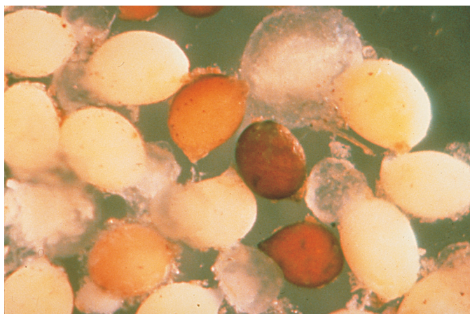
Adult females (white) and cysts (tan and brown) of SCN.