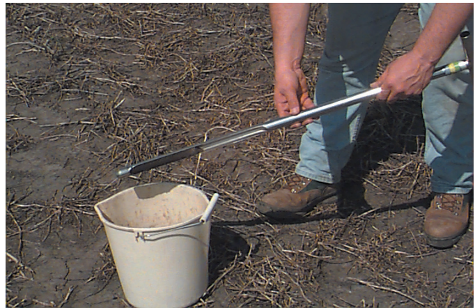
Soil probe containing one of multiple soil cores needed to test for SCN.

The result of a soil test for SCN, therefore, is a rough estimate of the actual population density of the nematode in the field. Fortunately, a precise measure of the SCN population density usually is not necessary to implement