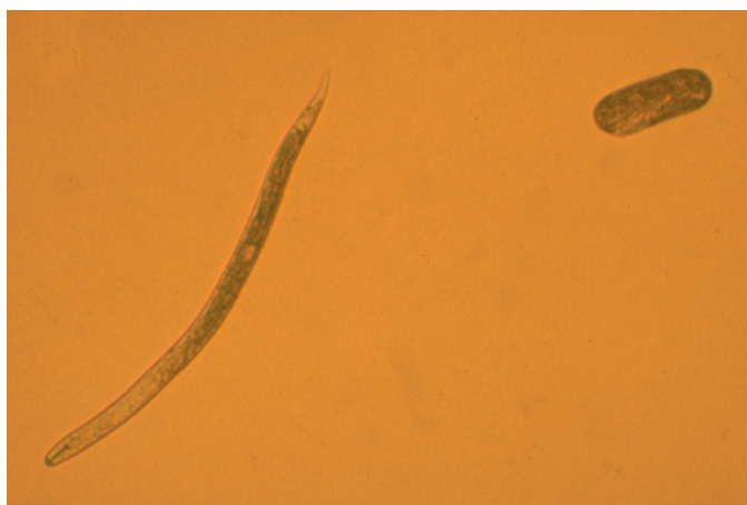
Hatched juvenile (worm) and egg of SCN.

Some laboratories offer both cyst and egg counts, whereas many others only offer egg counts. The processing fee for cyst counts typically is less than that for egg counts, but cyst counts do not provide as much information as egg counts because of the variable number of eggs per cyst.