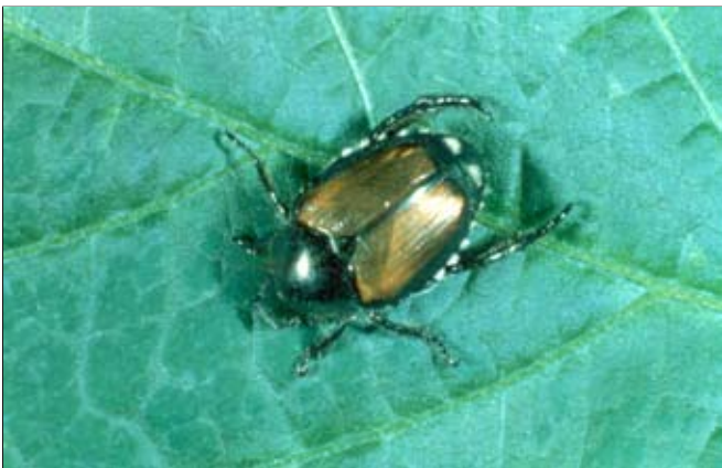
Figure 7. Japanese beetle adult.