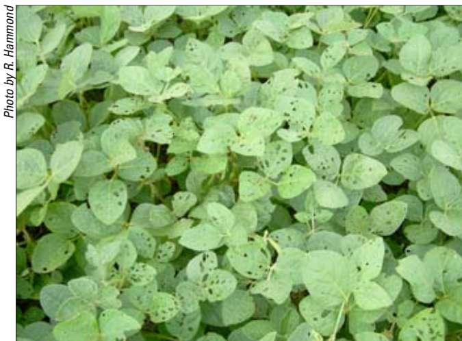
Figure 3. Bean leaf beetle damage on soybeans in early summer.

Bean leaf beetle passes through two generations in Ohio with the true first generation of BLB beetles appearing in early summer when adult feeding resumes (fig. 3). The second and final generation appears around late August or early September when it is more of a pod feeder. The time of peak occurrence of BLB adults per generation may differ from field to field depending on the date of planting because the time of initial egg laying in a field depends on the time of initial emergence of the crop that attracts the overwintering beetles to the site. Growers should see the fact sheet http://ohioline.osu.edu/ent-fact/pdf/0023.pdf for more information on BLB.