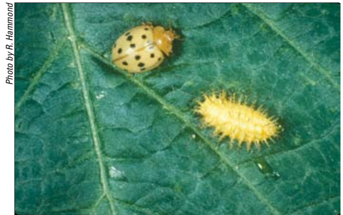
Figure 4. Mexican bean beetle adult (left) and larva (right).

The MBB also overwinters as adults in wooded areas near fields, entering soybean fields as they emerge from their overwintering sites. As with the