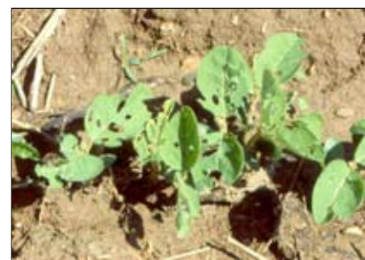
Figure 2. Bean leaf beetle feeding damage on soybeans after emergence.

The BLB is a small beetle that varies in color from golden yellow to red, generally having six black spots on the wing covers, and always having a black triangle on the area centrally behind the thorax (fig. 1). The BLB overwinters in the adult stage, and resumes activity in the spring. It will be found feeding on soybean foliage soon after soybean emergence (fig. 2). The overwintered BLB adults feed on foliage and deposit their eggs in the soil. Unless beetle densities are abnormally high and feeding significant (> 40% leafloss), this early season defoliation is usually not considered economic. If a soybean field is late planted relatively to other