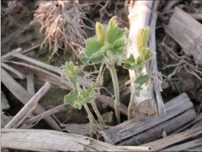
Figure 6. Gray garden slug defoliation of young soybean plants.