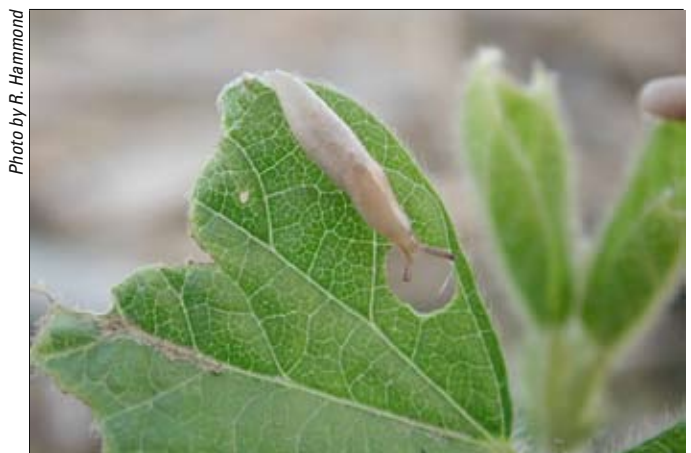
Figure 5. Gray garden slug.

The GGS (fig. 5) is often a problem in soybeans grown using conservation tillage practices, especially no-till. While able to cause significant stand reduction from feeding on germinating plants, GGS can also inflict significant defoliation to young soybean plants (fig. 6). Unlike the other pests discussed, foliar insecticides will have no impact on GGS or other slug species. Management comes from tilling the soil and the burial of crop residues, or the use of molluscicide baits. Growers should see the fact sheet http://ohioline.osu.edu/ent-fact/pdf/0020.pdf for more information on GGS.