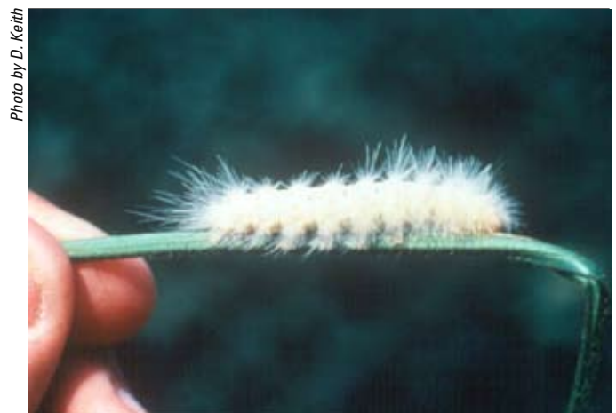
Figure 13. Yellow woollybear caterpillar.

fields is advised, especially if the field in question is the first to emerge in an area. Although economic injury is relatively rare at this time of the season, severe leaf feeding can cause significant damage and should be stopped if defoliation goes over 40%, plants are being stunted, and beetles are still actively feeding.