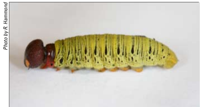
Figure 12. The silver spotted skipper.