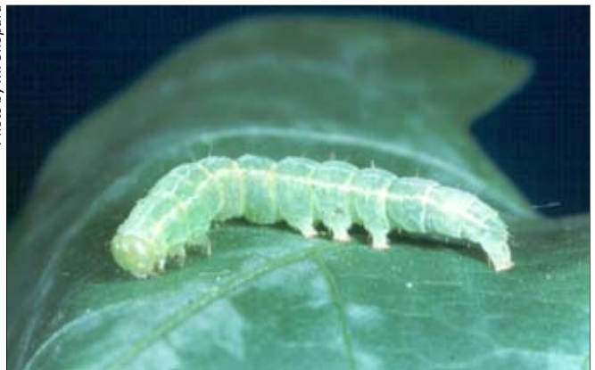
Figure 9. Green cloverworm caterpillar.