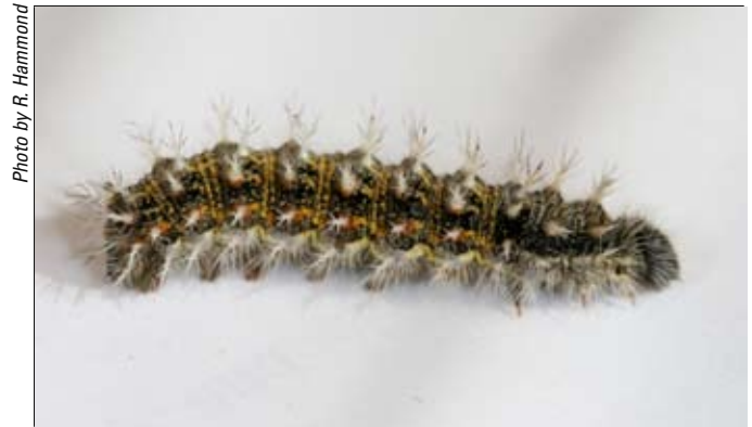
Figure 11. The painted lady, also known as the thistle caterpillar.

Early planted soybeans, relative to other fields in the area, may attract large numbers of overwintering BLB and MBB. Periodic inspection of early planted