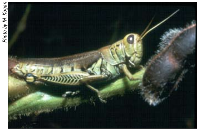
Figure 10. Grasshoppers feed on soybean leaves and pods.

Numerous grasshopper species (fig. 10) will often be found in soybean, often at high numbers feeding on both leaves and pods. When sampling, growers will usually find that most of the grasshoppers occur on the field edges, having come in from grassy borders.