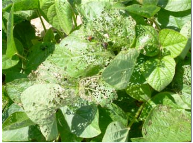
Figure 8. Japanese beetle feeding damage.