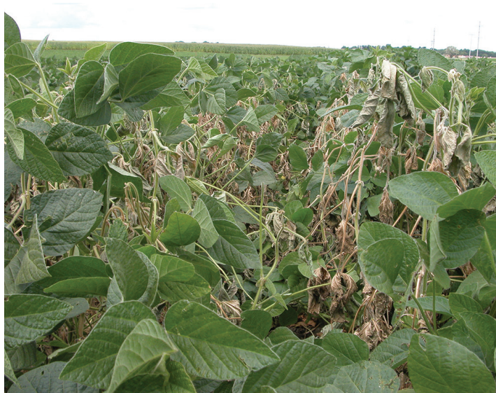
Symptoms of white mold include wilting, lodging, and plant death.

Yield loss is more severe when plants die prematurely or stems are girdled. In addition to causing yield loss, white mold can impact seed quality and reduce grain price because of foreign material at the elevator if sclerotia are present. After harvest, check seed lots for sclerotia and infected seeds. Infected seeds are usually smaller, lighter, white, and cottony.