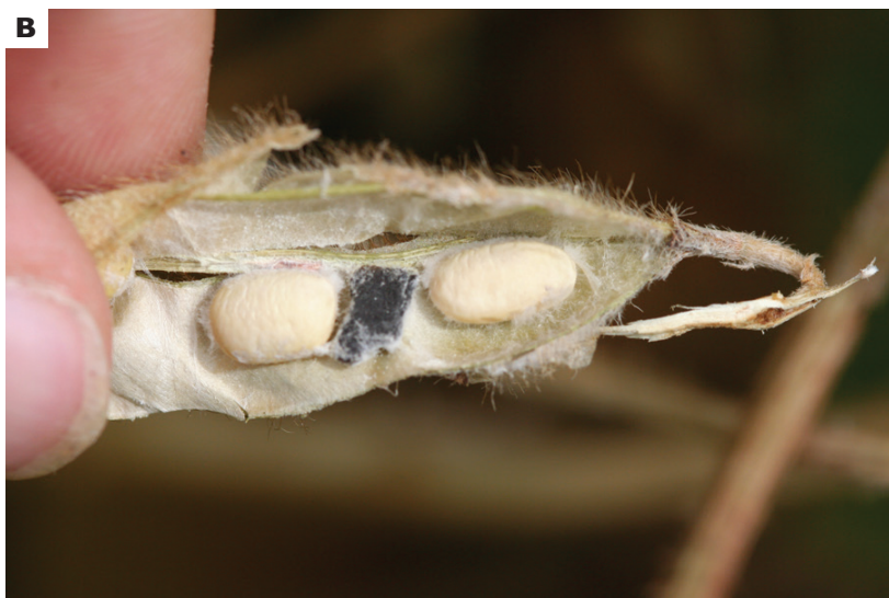
(A) Sclerotia of Sclerotinia sclerotiorum in harvested grain and (B) infected seed with a sclerotium in a pod.