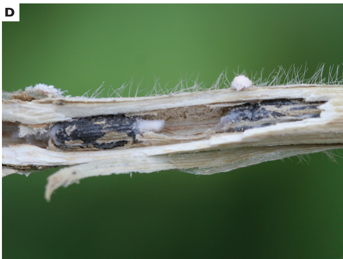
(A) Susceptible flowering soybean variety, (B) apothecia of Sclerotinia sclerotiorum which produce ascospores, (C) signs of S. sclerotiorum include white tufts of mycelium and sclerotia produced in and outside stem tissue, and (D) sclerotia of S. sclerotiorum inside a soybean stem.